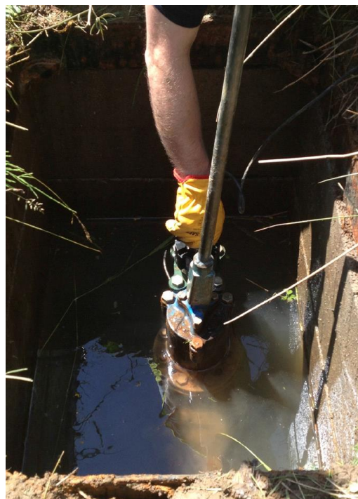
Enigma-hyQ logger installed on 500mm PVC main via fire hydrant

Shown below is the schematic of the five Enigma-hyQ loggers positioned on the main over a total distance of 3527.7m. These schematics interface with Google Maps and are a feature in the software allowing users to easily lay out pipe networks. The schematic gives easy visualisation of logger positions and correlations requiring investigation; it also allows clicking on any Enigma-hyQ logger to hear the noise recorded.