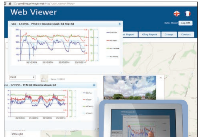
Network hydraulic data available on Google Maps*

PrimeFlo3 data can be managed using the PrimeWorks water data management software. Data is also available via the PrimeWeb on-line network monitoring facility giving remote access to observe changes in network conditions, water usage, nightlines, etc. PrimeFlo3 data can be displayed via Google Maps*.