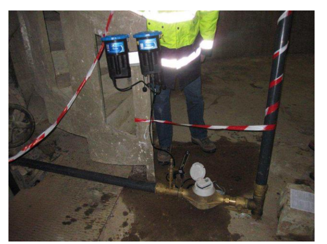
By-pass with meter and Xstream installed

Network divided into ten sectors each with 5-6km of