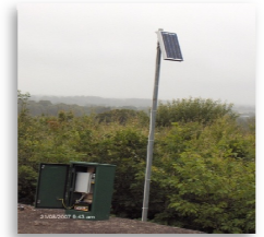
XiLog+ powered by solar energy (Ireland)

When monitoring water networks the resolution of data and frequency of data transmission is limited by the required battery life, and subsequently the need to visit site to replace batteries. Battery life is also considerably shortened by the number of retries needed to connect to the cellular network in areas of poor signal strength.