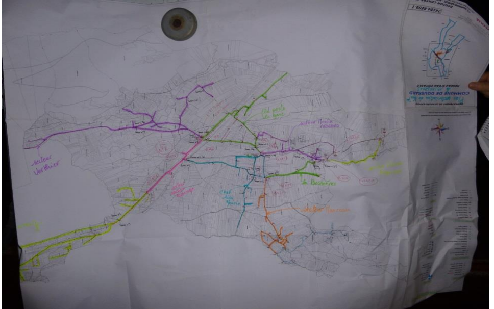
The network was divided into nine sectors prior to commencement of the step-test.