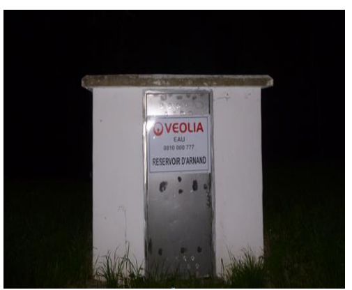
The tank supplying the sectored network.