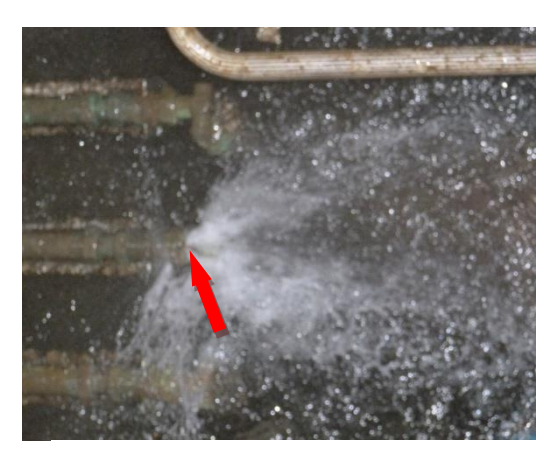
The leak identified at valve shut 9.

Other valve shuts resulted in insignificant flow reductions and no further leakage location surveys in these sectors.