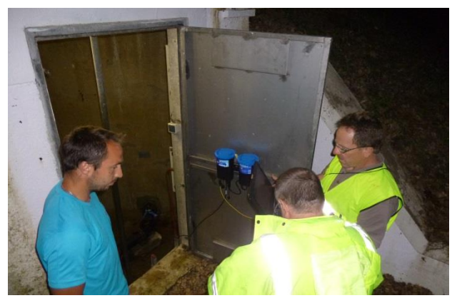
Despite no GSM signal (phone had no connection) using GPRS 100% of data uploaded by the XStream