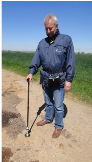
Detecting the tracer gas at this test site