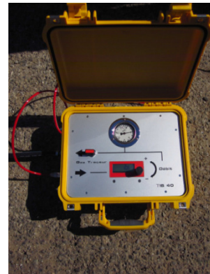
The Injection Kit controls the tracer gas flow and pressure

The leak is located at 250 metres from the injection point. A flow of 10m 3 /h means that the gas is travelling at 4cm/s. A minimum of 2 hours 30 minutes may be needed for gas to get to the leak position. Generally gas takes around one hour to go from 1 metre depth of ground. It's better to make holes on the ground every 2 metres for gas detection. One air valve located after the leak position may be used for checking H 2 presence.