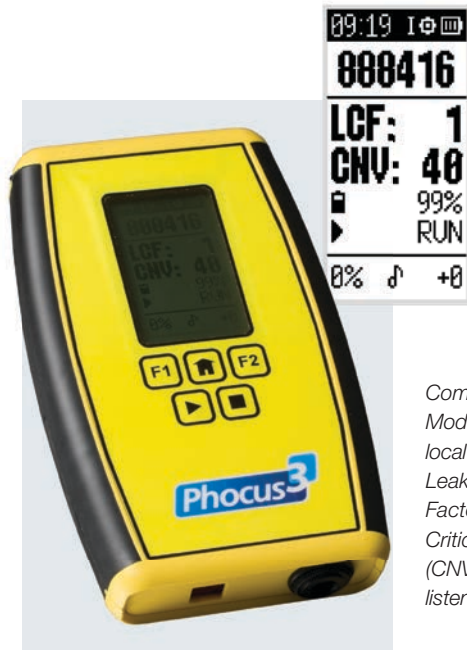
Communications Module provides local display of Leakage Confidence Factor (LCF) and Critical Noise Value (CNV), plus facility to listen to leak noise.

The Communications Module enables local programming/readback of the Phocus3 logger via infra-red communications. It gives on-site display of the Critical Noise Value and Leakage Confidence Factor for the most recent night. Data may be collected for the most recent 12 months and transferred to the host software for processing. The Communications Module also allows the user to listening via headphones, to confirm the presence of leak noise.