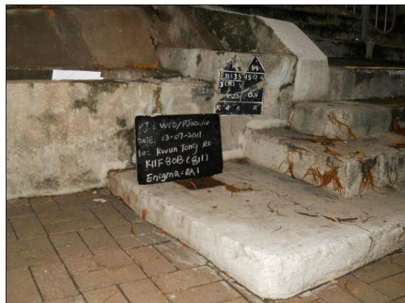
Sample locations and installations for Phocus.sms